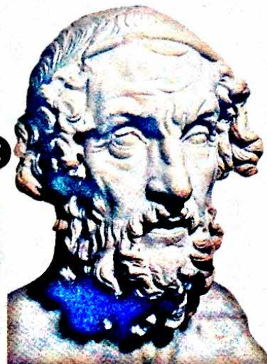
The blind poet Homer. Detail from statue found near Naples (probably 2nd century A.D.).

The background for Odysseus's story is found in the Iliad , which is set in the tenth and final year of the Trojan War. According to the Iliad , the Greeks attacked Troy to avenge the insult suffered by Menelaus, king of Sparta, when his wife, Helen, ran off with Paris, a young prince of Troy. The Greek kings banded together under the leadership of Agamemnon,