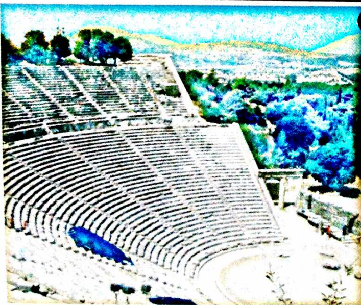
Ruins of an amphitheater at the temple of Hephaestus in Athens.

being cooked over charcoal, the sound of voices. Imagine wine being freely poured, the flickering reflections of the great cooking fires, and the torches that light the room. A certain anticipation hangs in the air. It is said that the blind minstrel Homer is in the city and that he has new stories about that long war in Troy. Will he appear and entertain tonight?